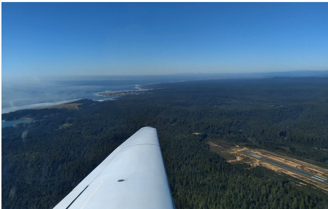
Little River airport (right), at 500 ft above the sea.