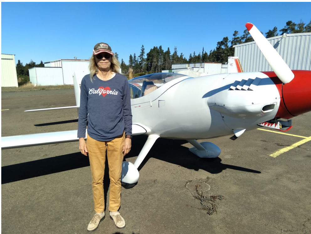
On the ground, with Caro 1 which drew some interested looks

It was quite busy on the frequency and around the airport, after I had landed, several other airplanes arrived, also making use of the clear weather.