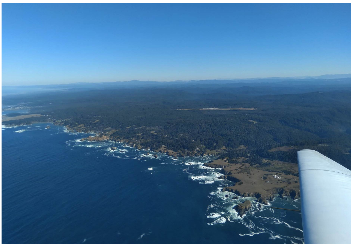
Just off the coast, descending towards pattern altitude, with the airport in the background