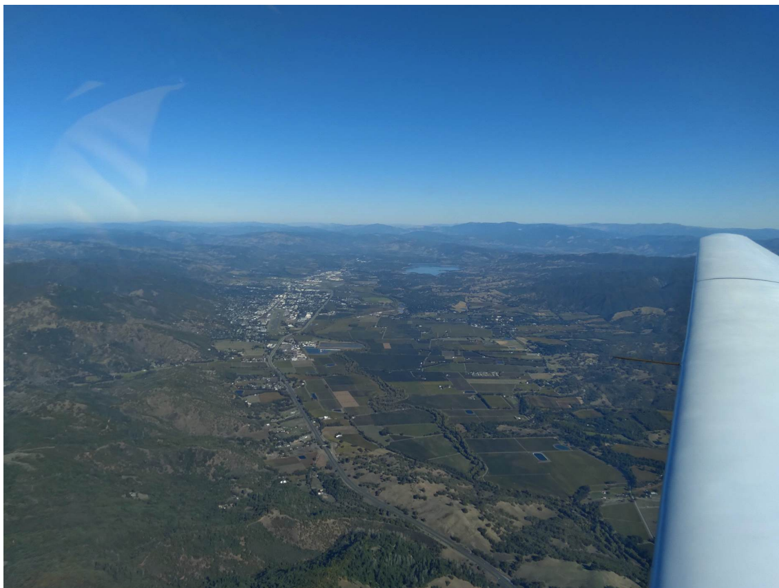
Ukiah in the distance

Once I reached the last few ridges before the sea, the vegetation changed dramatically. Where before it had been dry with few, widely spaced trees and fields and pastures in the valleys, now the mountains were covered with dark green dense growth of tall trees.