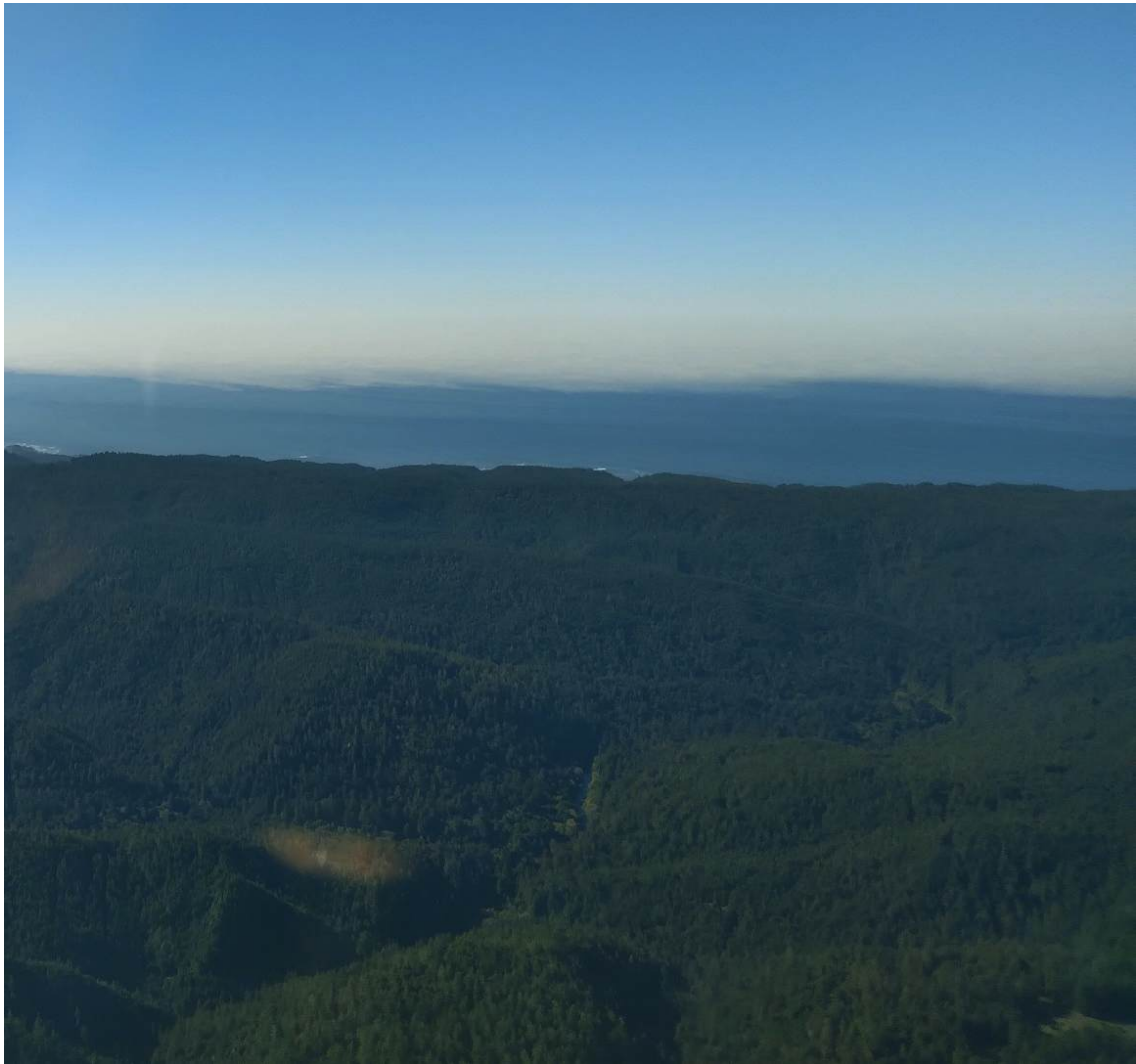
The coastal forest

The fog had retreated from the coast line and the airport, situated in a clearing on a plateau, was easy to spot.