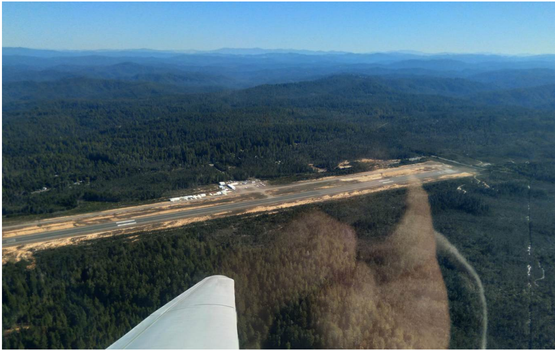
Little River, looking northeast

It was quite busy on the frequency and around the airport, after I had landed, several other airplanes arrived, also making use of the clear weather.