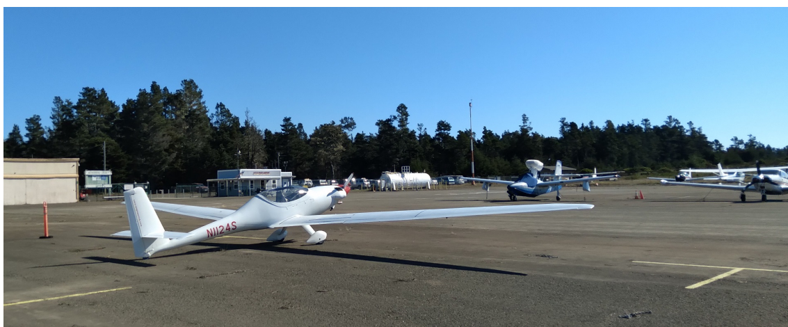
Back at the airport